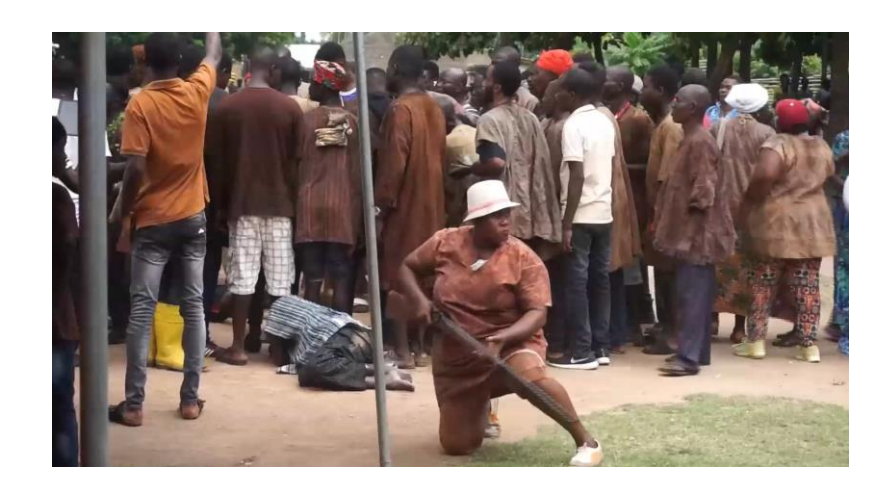
A female Asafo member