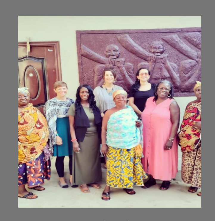
Queen Mothers in Ashanti region, July 2022