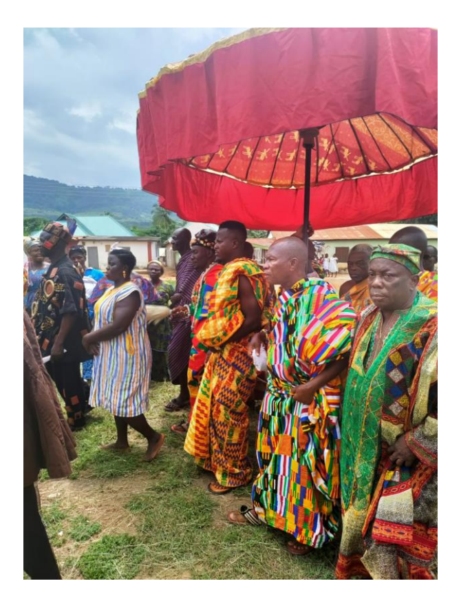
Togbui Afede, Paramount Chief of the Ho-Asgoli Traditional area