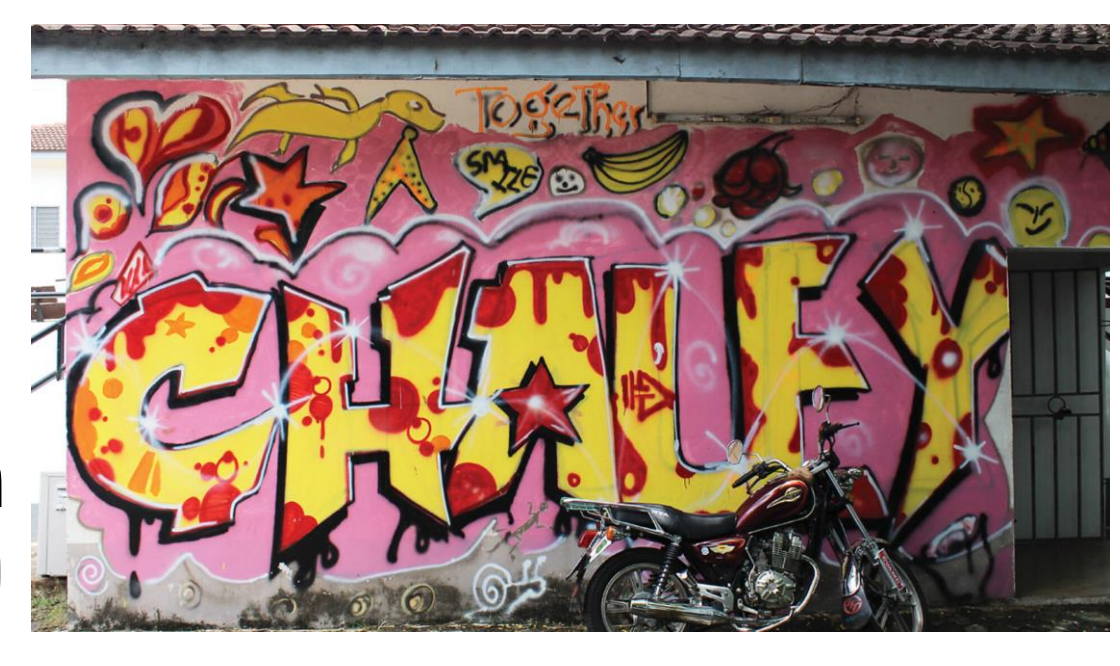
Image credit: Daniel Neilson, <u>Guide to Ghanaian slang</u> and <u>dialect</u>

develop from contact between speakers of two different languages, in this case British English and the various Ghanaian languages (e.g. Ga, Twi, Ewe, etc)