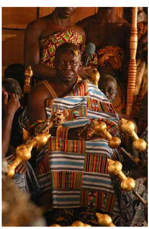
Asantehene Osei Tutu II wearing kente cloth, 2005