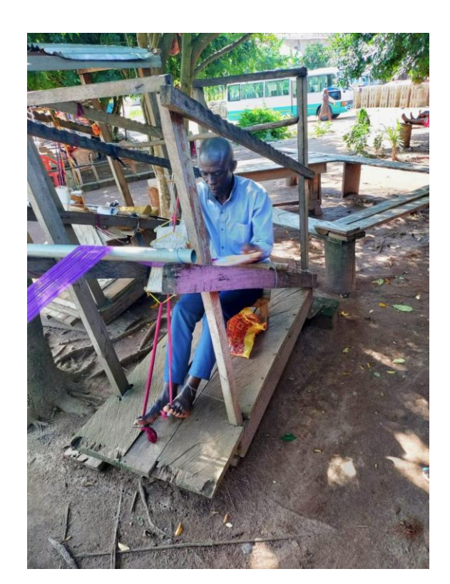
The History and Significance of Kente Cloth