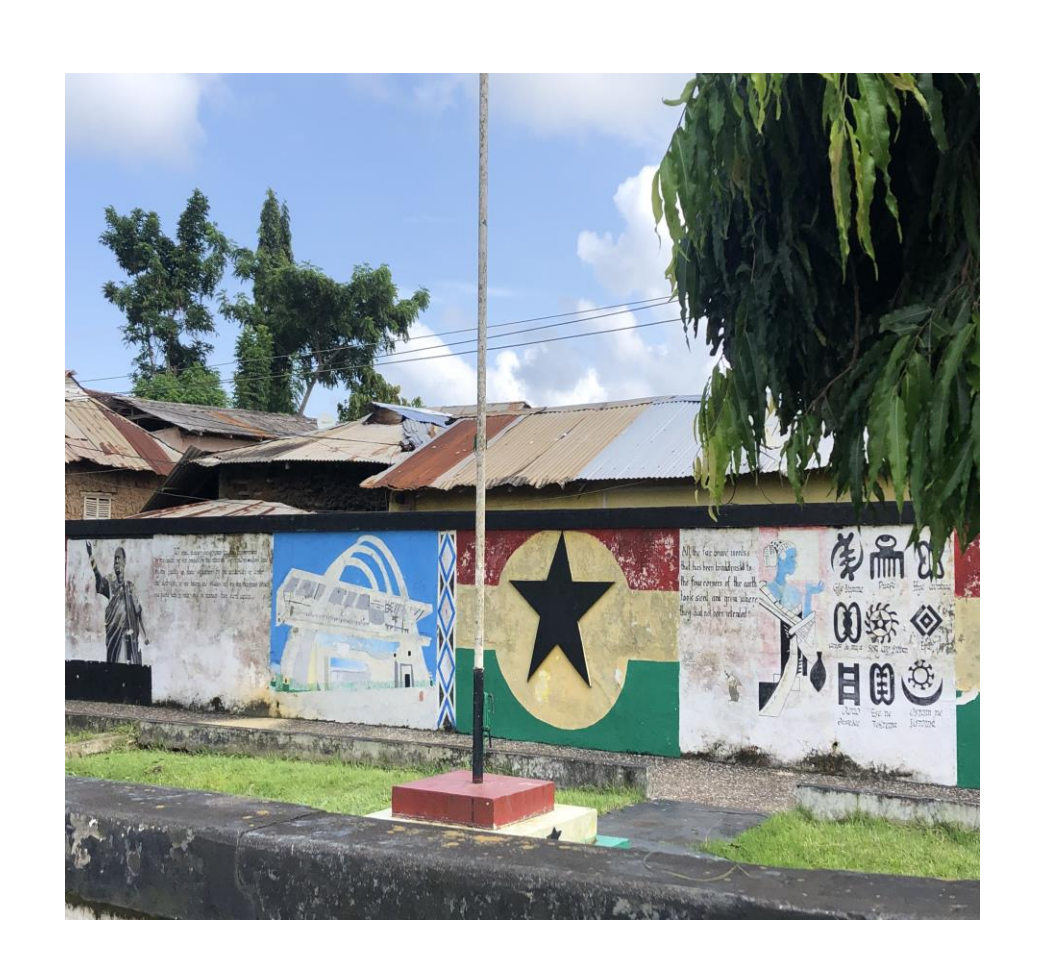
Kwame Nkrumah's house in Nkroful, Ghana